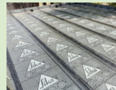
waterproofing of roof