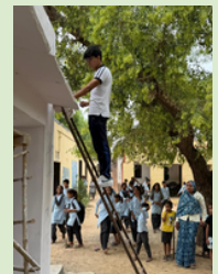
Students revamping the anganwadi