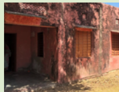
Anganwadi in Akodiya before Adhikar's work