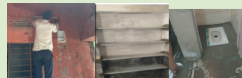
Electricity connections, storage space building and toilet re-installations