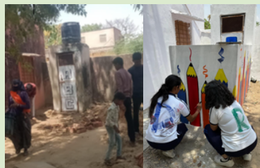
BEFORE & AFTER BATHROOM