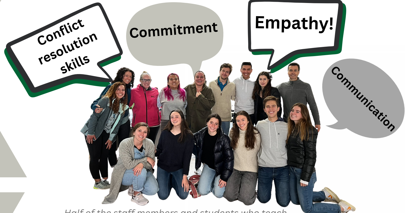
Half of the staff members and students who teach