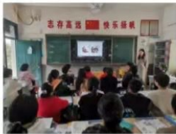
Online and offline teaching