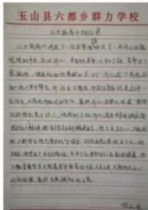
Feedback from students who watched our video