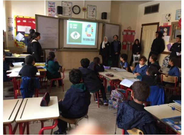
Our Presentation to the elementary students

We started collecting information about climate action and we looked deeper into our goal. After realizing how critical our goal is, we thought of the first step of how to spread awareness across our Egyptian society. The first step to build a healthy community is starting with the community's seed of its future, that is why we started by our school's children. After collecting enough information and scientific facts, we started preparing our presentation. We entered two classes of 25 students, so we affected 50 students in total. First, we visited Grade 3, they understood our presentation but we took nearly 1 hour to present which was somehow boring. When we practiced more, then visited the class of Grade 5, we took half of the time.