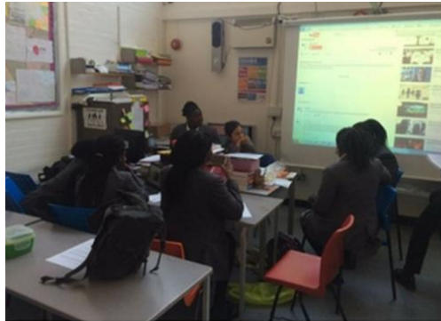
YEAR 7, 8 AND 9 DEKI LOANS